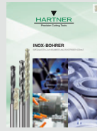
▼ INOX DRILLS