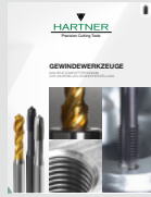
▼ THREADING TOOLS