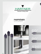
▼ CHAMFERING MILLING CUTTERS