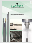
▼ GUN DRILLS