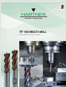
▼ TF 100 MULTI-MILL