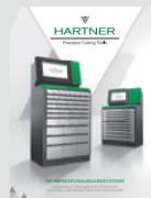
▼ TM VENDING MACHINES