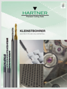
▼ MICRO-PRECISION DRILLS