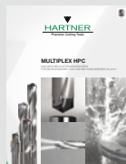
▼ MULTIPLEX HPC