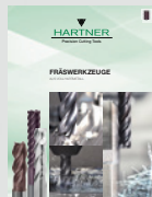
▼ SOLID CARBIDE MILLING CUTTERS